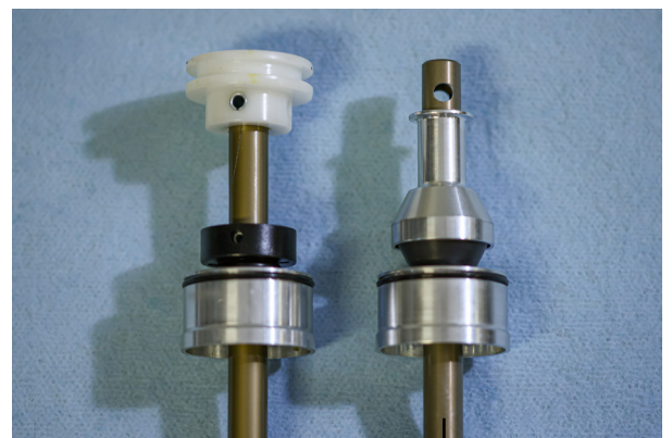
(Example first generation 36 Evol air shaft)