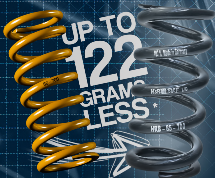
conventional Bike Spring